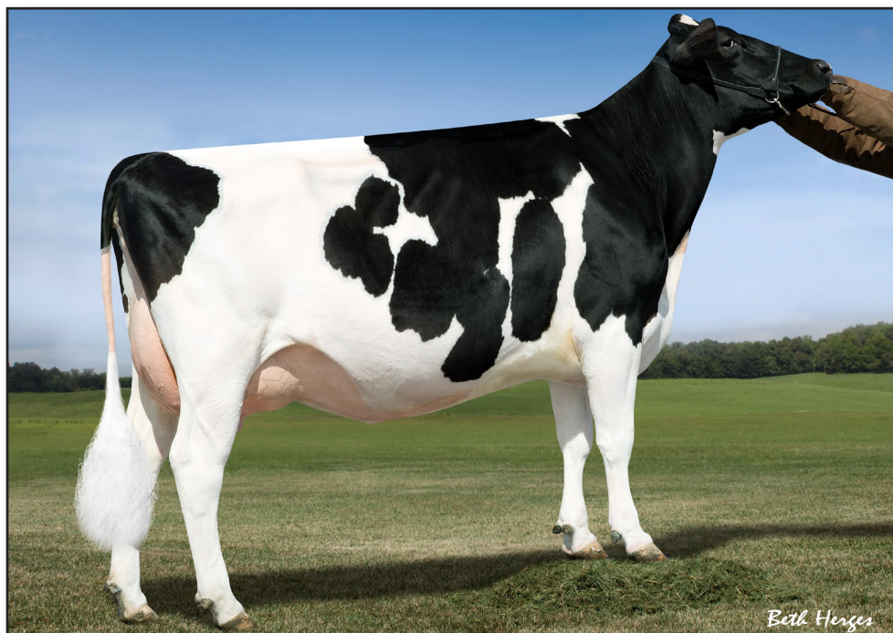
S-S-I SHAMROCK MENNA7392-ET (VG-85) Granddam of Lot 4