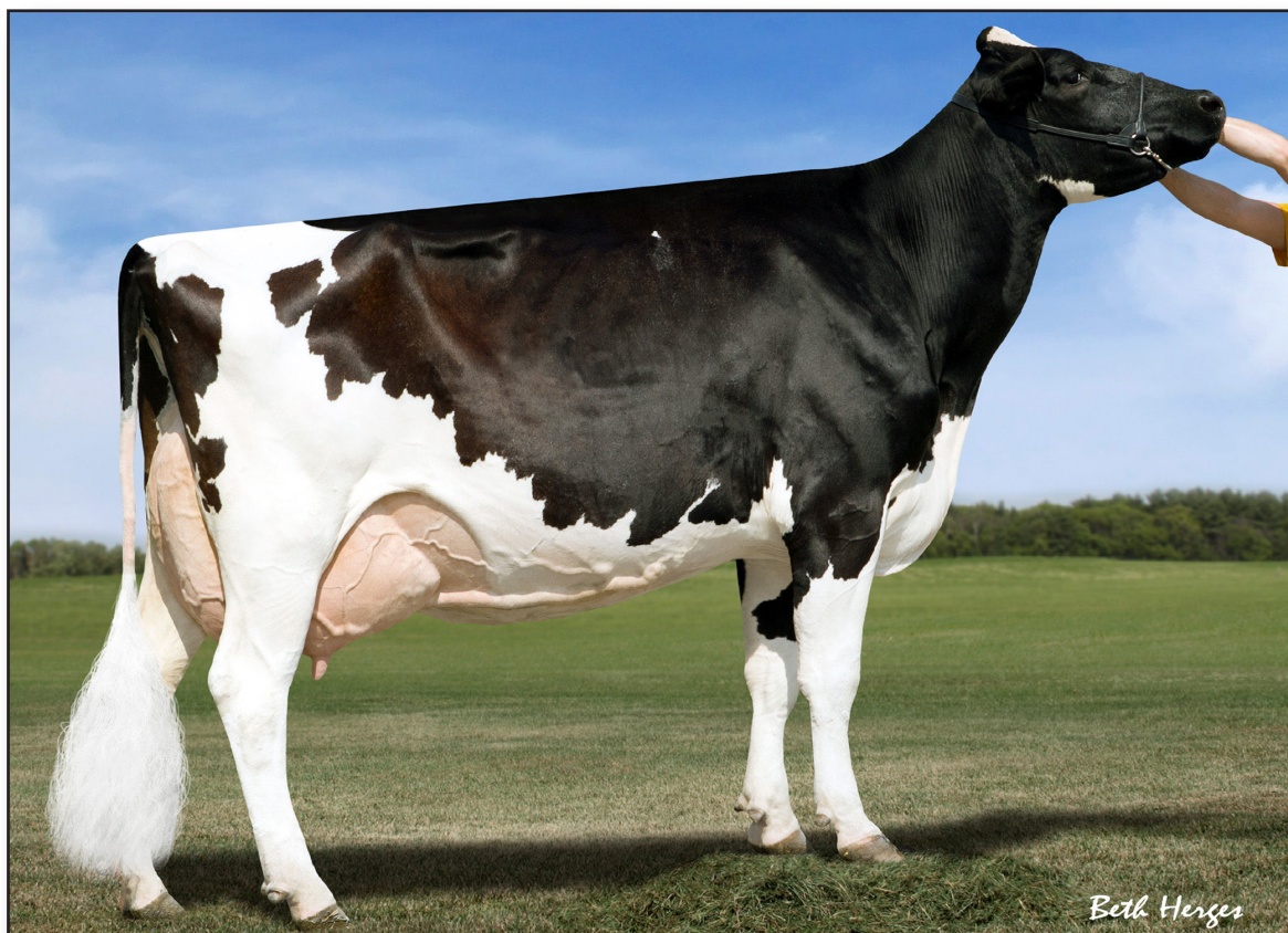
SONNEK DAMION CHARLIE (EX-94-3E) Dam of Lot 1