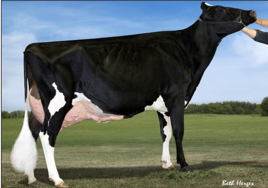
Deboer Goldwyn Snow Velvet (EX-93) Half Sister to Dam of Lot 79