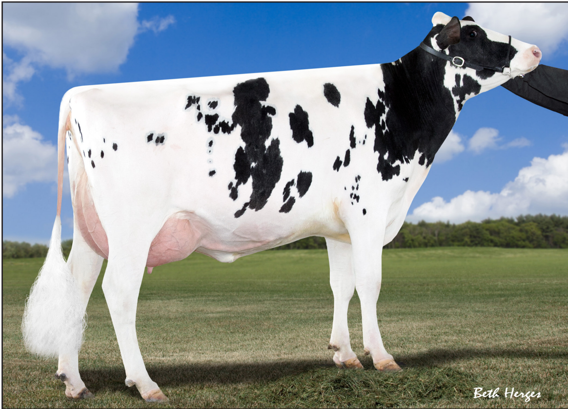
HENDEL PLT MARILYN 3021-ET Grandam of Lot 3